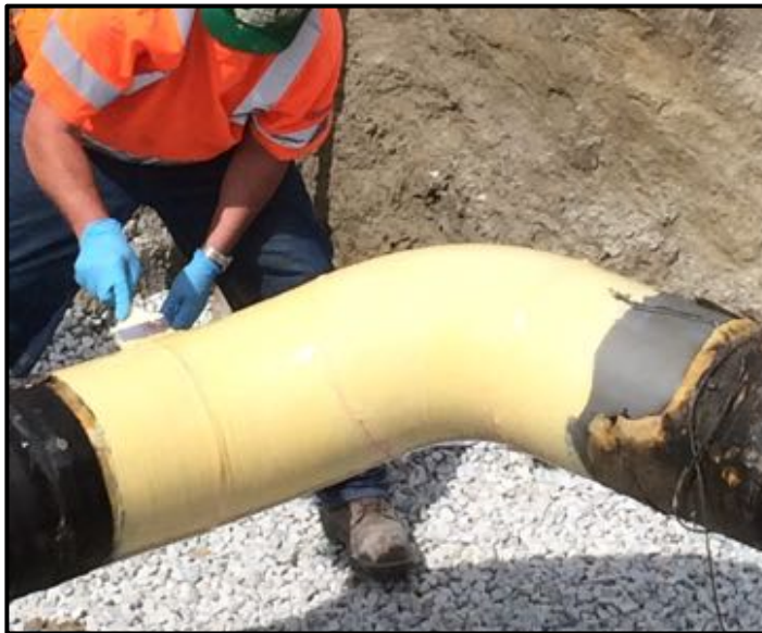
Applying the primer

The actual installation time was approximately an hour, with just two trained technicians. No heavy equipment or hot work was required for the installation, and the line was in operation with no disruption in production. Below are photos of the installation process, as well as the completed repair.